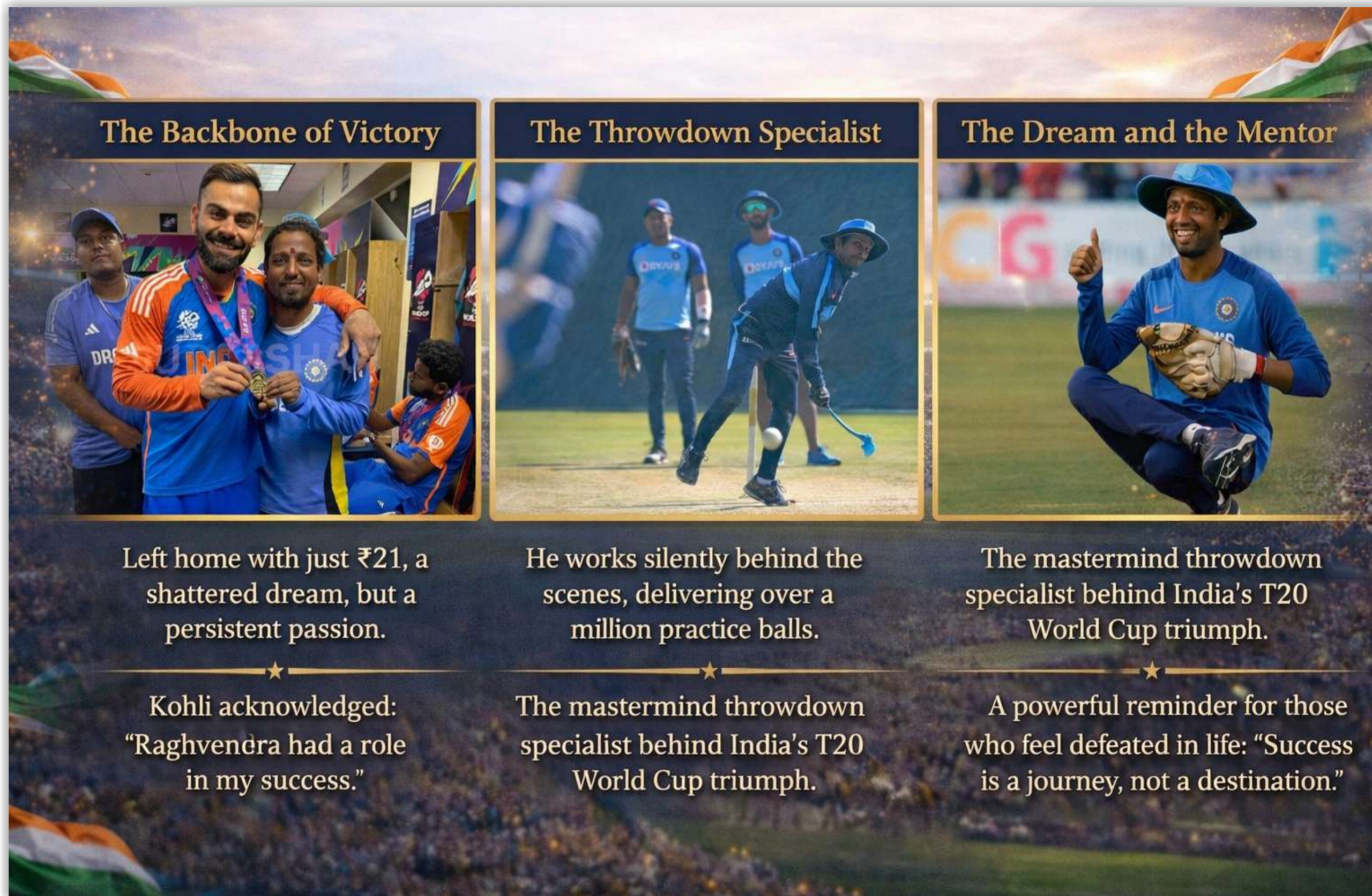
The Backbone of Victory

Left home with just ₹21, a shattered dream, but a persistent passion.