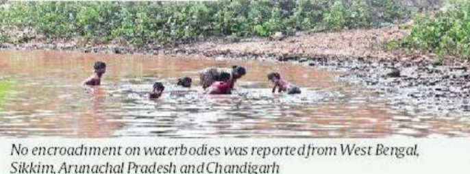
No encroachment on waterbodies was reported from West Bengal, Sikkim, Arunachal Pradesh and Chandigarh

In accordance with the Centrally Sponsored Scheme "Irrigation Census," the Ministry of Jal Shakti has begun the First Census of Water Bodies and the Sixth Minor Irrigation (MI) Census. The appropriate State Governments are largely responsible for taking action because water is a state issue under the 7th Schedule of the Indian Constitution. The Central Government provides technical and financial support for their efforts through a variety of plans and programmes. As a sample, the Repair, Renovation, and Restoration (RRR) of Water Bodies is covered by the Pradhan Mantri Krishi Sinchayee Yojana (PMKSY)-Har Khet Ko Pani (HKKP) programme. Water body information was only accessible at the village level up until the fifth minor irrigation census. Data on all varieties of waterbodies in both rural and urban regions were included in the first water body