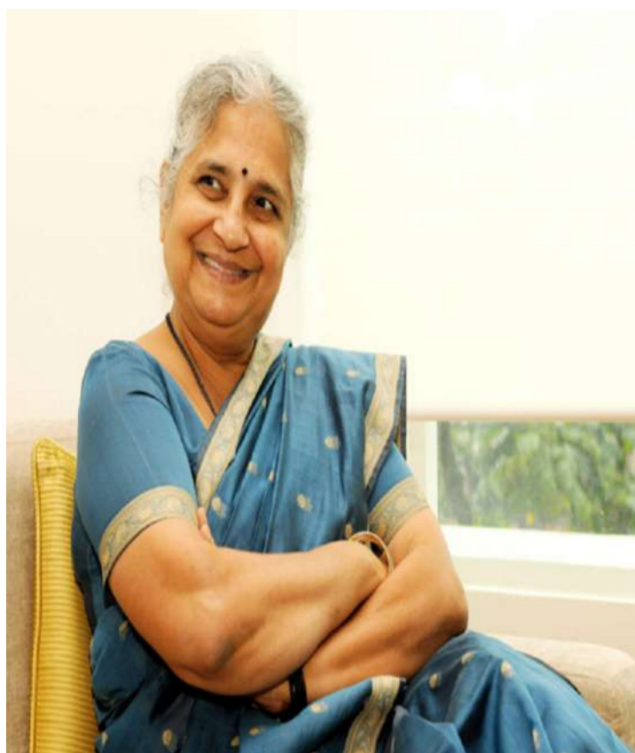
Mrs. Sudha Murthy

Women have been a great inspiration and a facilitator for cultural progress, whether it's Mother Teresa, Sarojini Naidu, or Kalpana Chawla. Sudha Murthy is one such personality who has had a significant impact on Indian culture. Sudha Murthy is an author, humanitarian, and entrepreneur who are well for such a brilliant author, helping the learning of disadvantaged children, by being the geniuses driving Infosys, one of India's major IT companies. Sudha Murthy's charity activity has received global acclaim while wearing soberly in traditional Indian style. From being India's first female engineer to leading a firm like Infosys, her dedication to making an impact in community and her professional path have been essential in doing so.